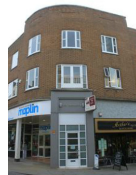
Front View of Office

Second Floor 10b Shoplatch Shrewsbury SY1 1HL Tel: 01743 350893 Fax: 01743 233619 Email: info@bjse.co.uk www.bjse.co.uk